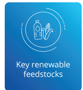
Key renewable feedstocks