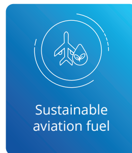
Sustainable aviation fuel